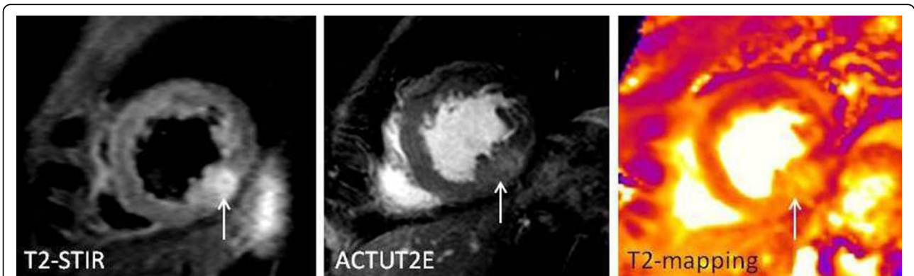
Figure 2 Short-axis slice repeated with the 3 techniques showing an oedematous area in the apical inferior wall.