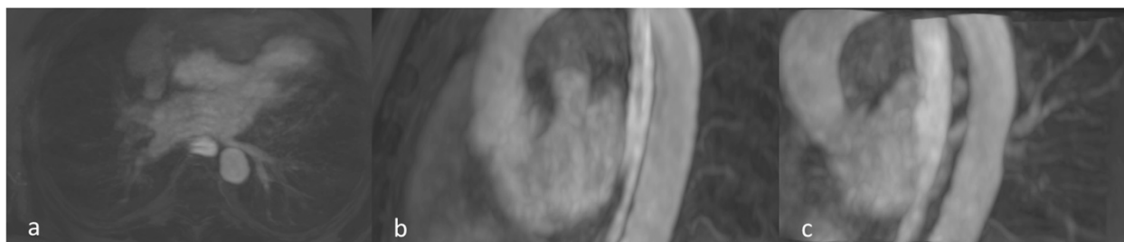
Figure 1 MRA of a 66 years old male with AF. MIP reconstruction in post-processing of MRA images acquired using both venous and oral Gadobenate Dimeglumine, 24 hr before percutaneous catheter ablation: (a) Axial MIP reconstruction (b) Left sagittal 3D MIP reconstruction (c) Left-Posterior 3D MIP reconstruction.

Pavone et al. first performed a MR scan with barium paste and the MR contrast agent, gadopentetate dimeglumine, to visualise the oesophageal lumen in patients with oesophageal stenosis [20]. MRA, besides providing detailed and complete imaging of the complex LA anatomy, does not expose the patient to ionising radiation [21]. Pollak et al. performed MRA with barium paste and gadopentetate dimeglumine in four candidates for RFCA; in one patient, the contrast agent passed to the stomach without enabling visualisation of the oesophagus [22]. A MRA scan is usually of longer duration than CT, and swallowing a contrast medium bolus at the correct time during a long breath-hold period could be difficult for the patient. In this study, using R-L phase encoding the