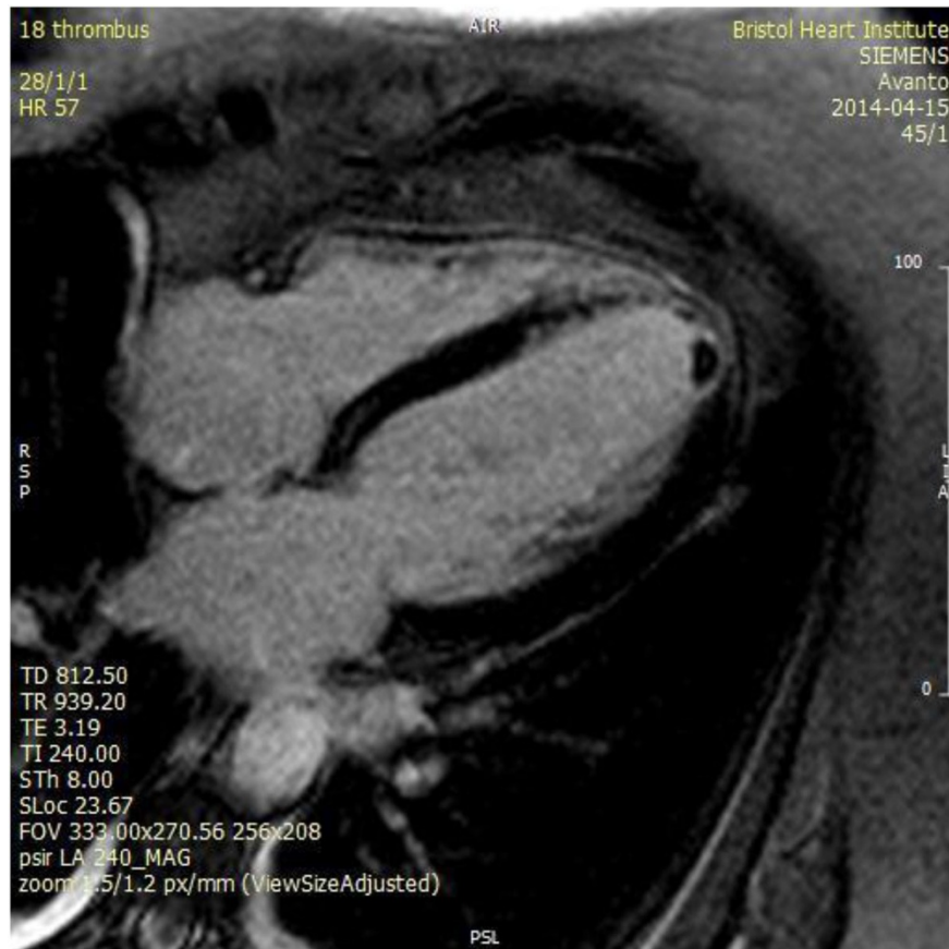
Figure 2 Long axis post gadolinium image showing apical thrombus.