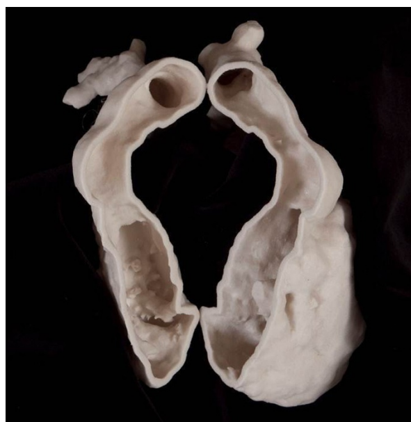
Figure 2 Cavity model of the right ventricle showing stenotic right ventricle to pulmonary artery conduit.