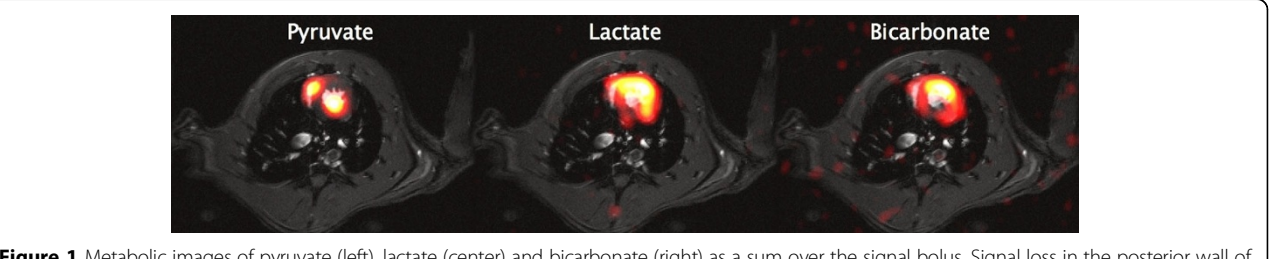
Figure 1 Metabolic images of pyruvate (left), lactate (center) and bicarbonate (right) as a sum over the signal bolus. Signal loss in the posterior wall of the heart is due to the sensitivity of the surface coil lying on the chest of the rat. The thin slice excitation reduces the impact of dephasing due to magnetic field inhomogeneities across the slice as well as partial volume effects. The result is a higher effective in-plane resolution.

By using the multi-echo technique, the requirements on the gradient system performance are relaxed. In contrast